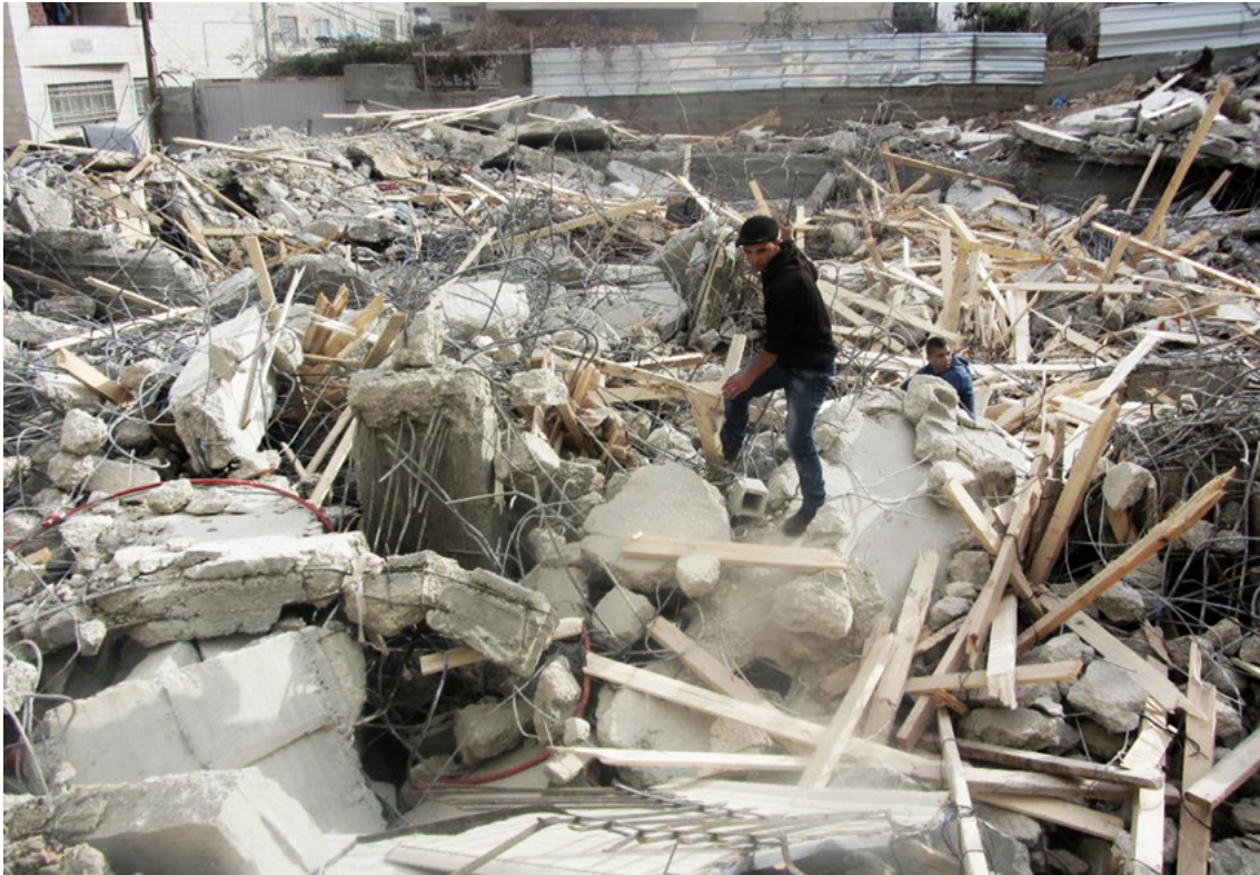
Ruins of 2-story home in Al-Issawiya, demolished on 27 January 2014 before the construction was completed.

Israeli authorities demolished 86 residential and 87 non-residential units in East Jerusalem. 31