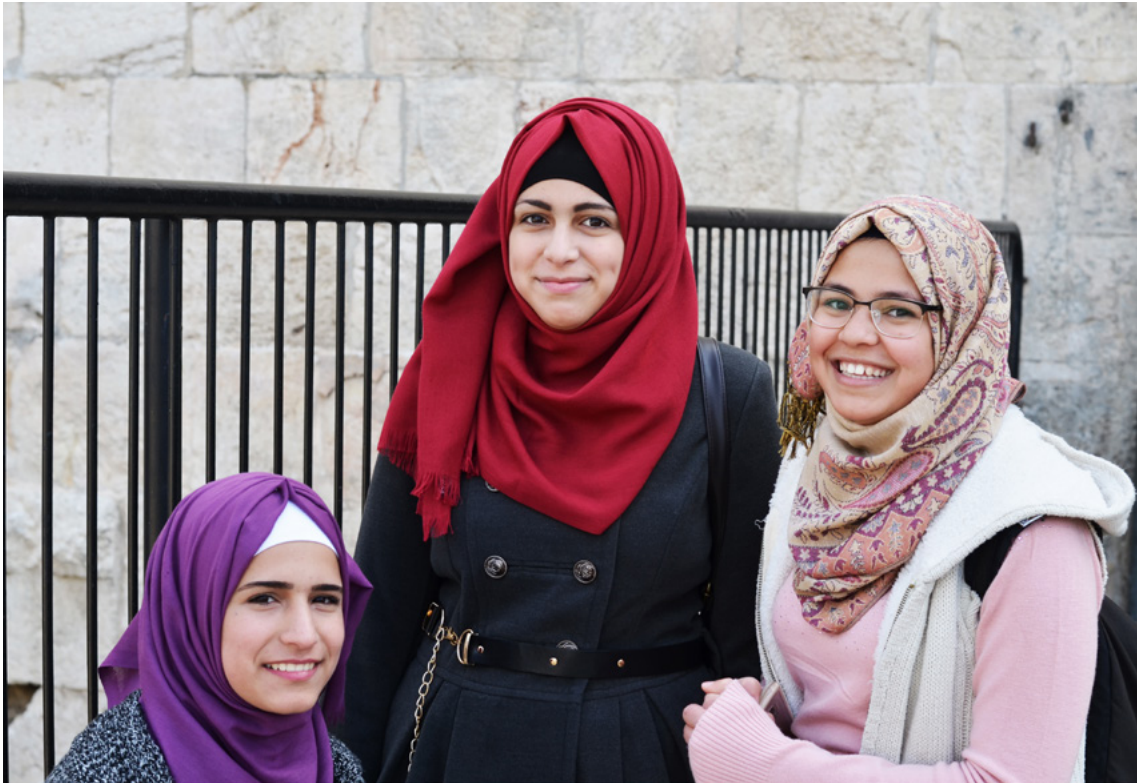
40 per cent of the Palestinians are younger than 25.

coming from young Palestinians, and they need to find this. To do so, they need knowledge. They need to be able to gain in-depth understanding of the situation they are in, their history and their identity. Eventually, this has the potential of letting them get what they desire most, namely a life with dignity and freedom. The question is, what can be done to achieve this? The following three recommendations will shed some light on this.