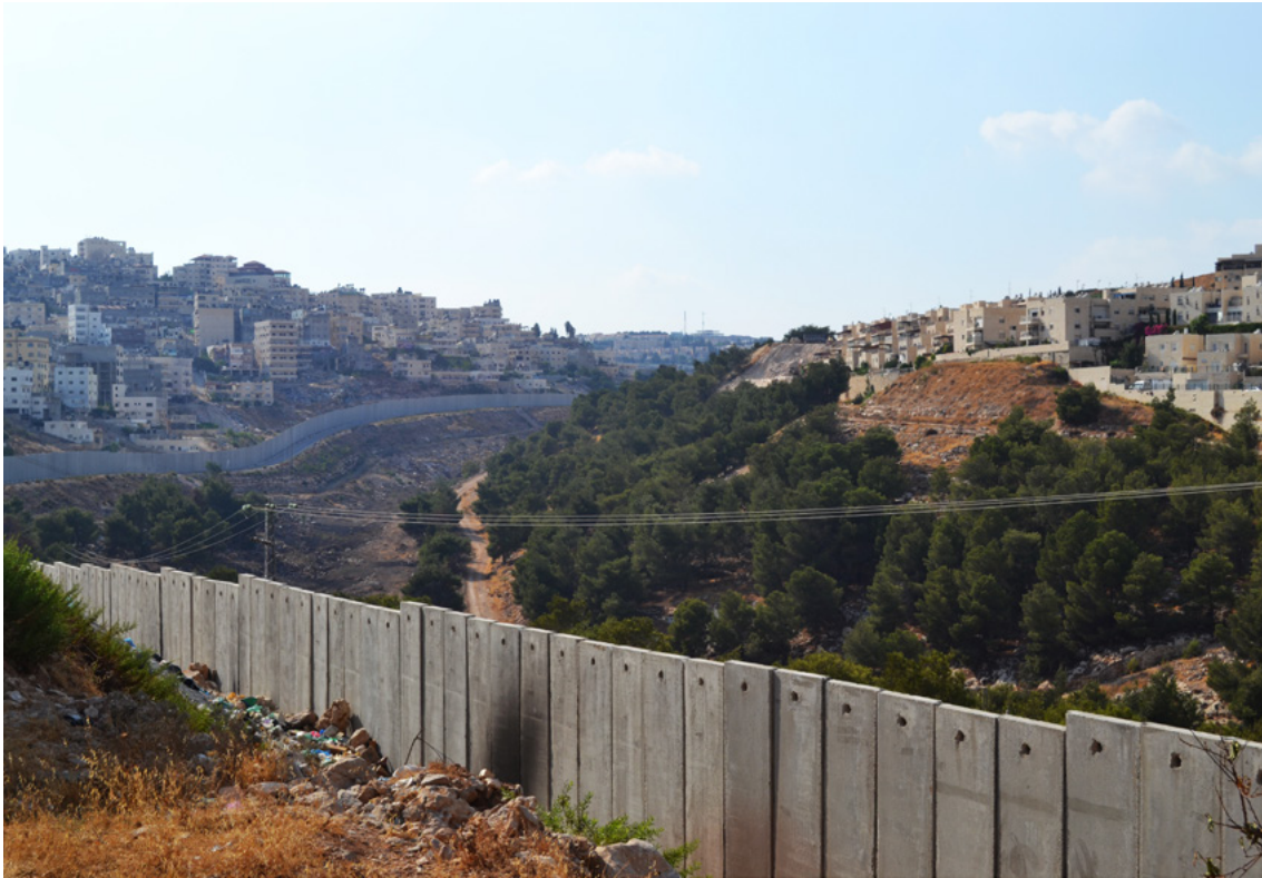
The barrier with Pisgat Ze'ev on the right side and 'Anata and Shu'fat refugee camp on the left.

Should practical steps be taken to cut off the neighbourhoods beyond the Separation Barrier or to revoke, en masse, their inhabitants' permanent residency status, we can expect a further erosion of conditions in the neighbourhoods inside the barrier, at that point administratively displaced from the city and transferred to contrived local authorities. We can also expect another wave of Palestinian migration to the already socio-economically marginalised East Jerusalem neighbourhoods inside the barrier, as occurred immediately after erection of the barrier, driven by fears of the permanent revocation of residency; and, in response to increasing housing shortages, an upsurge in the number of Palestinian residents renting or buying in Israeli neighbourhoods/settlements such as Pisgat Ze'ev and French Hill. Under conditions of acute uncertainty and anxiety, these trends can be expected to significantly elevate friction and the potential for violence in the city.