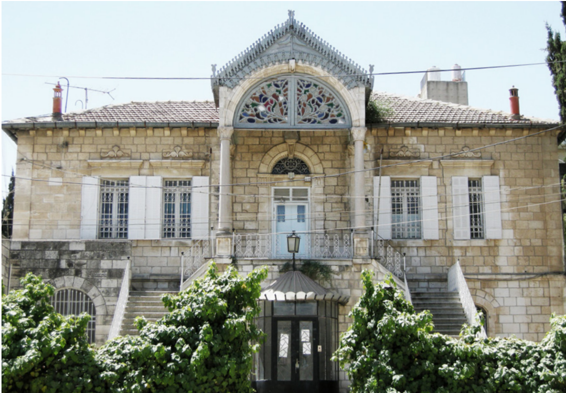
The Orient House.

the National Jerusalem Commission in 1988. This new body prepared the first Jerusalem Agenda with policy proposals for the development of the different sectors. In 2003, two years after the death of Al-Husseini and the closure of the Orient House, a second, updated agenda was published. This agenda was revised again in 2009 and 2017 by the Jerusalem Unit of the Office of the Palestinian President Abbas. A modified version was prepared by the Palestinian Economic Council for Development and Reconstruction (PECDAR) and submitted to the Organization of Islamic Cooperation Conference in 2013.