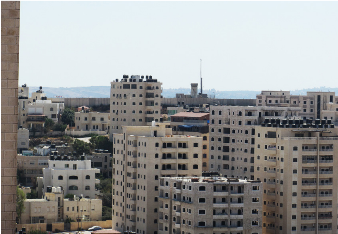
High-rise buildings in Kafr 'Aqab in 2017.

herding and living close to nature in tents and makeshift structures, whereas beyond the barrier a dense urban jungle of high-rise buildings has developed. Despite these and other differences, it is worth looking at the similarities between the Abu Basma Regional Council and the proposed new local council beyond the barrier.