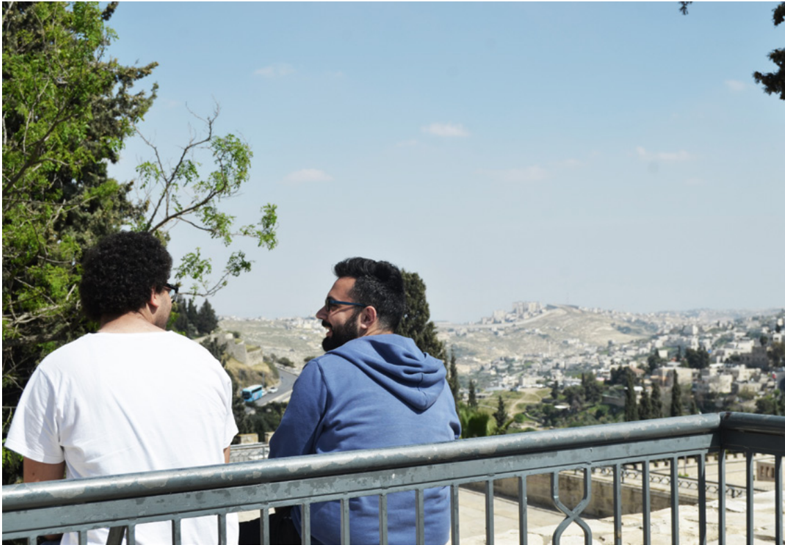
Two Palestinian friends.

opinions and for posts on social media. 115 Finally, Palestinians who work or study in West Jerusalem are often worried about expressing their opinions because they are afraid of losing their jobs or not being able to continue with their studies.