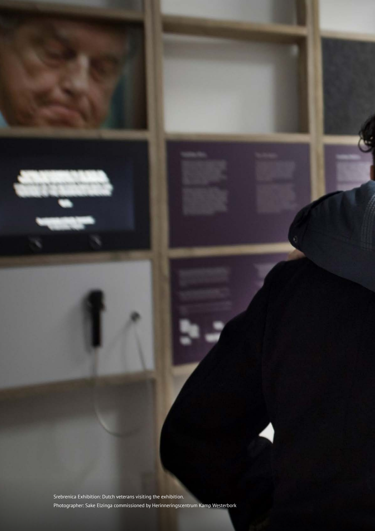
Srebrenica Exhibition: Dutch veterans visiting the exhibition.