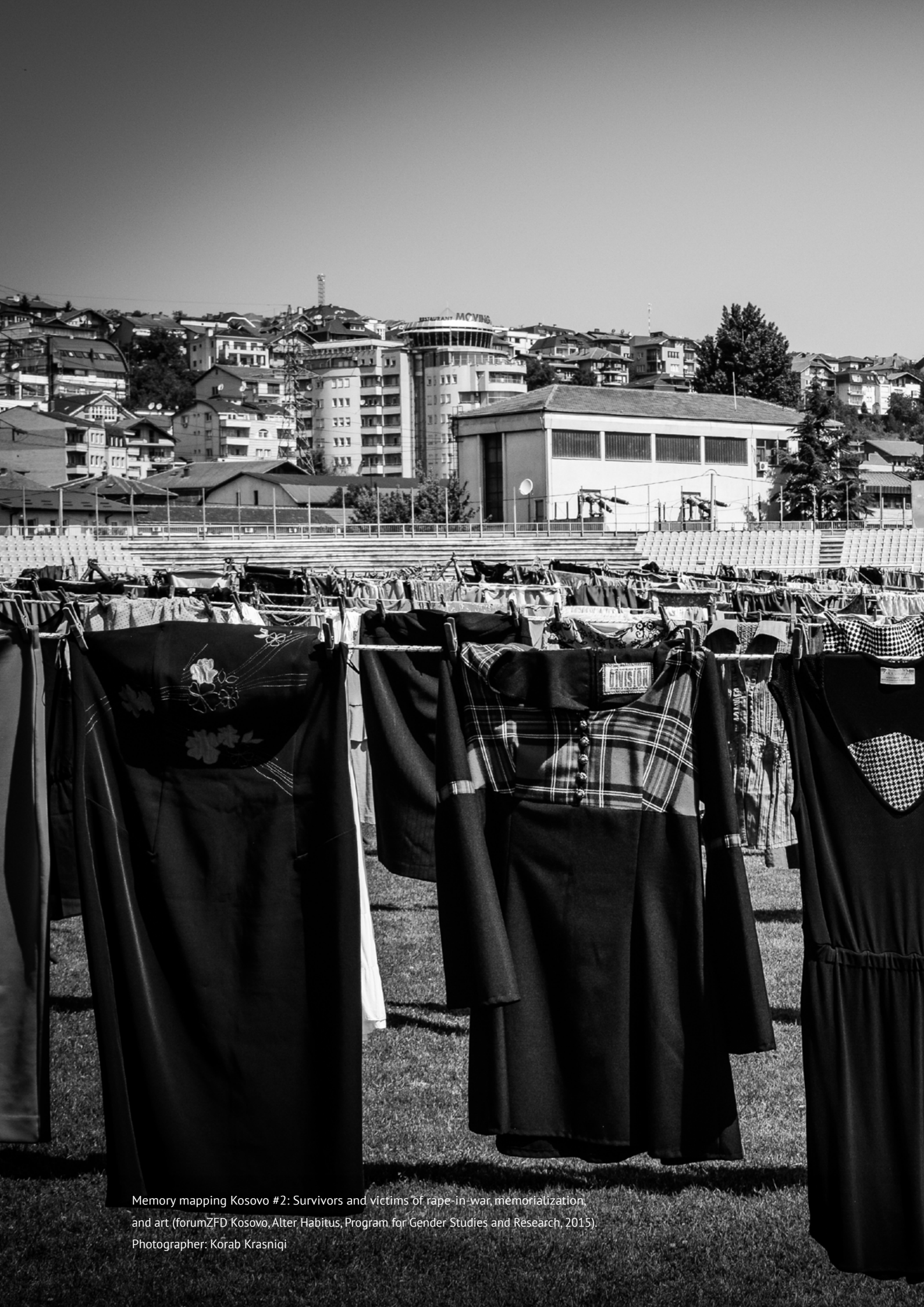
Memory mapping Kosovo #2: Survivors and victims of rape-in-war, memorialization, and art (forumZFD Kosovo, Alter Habitus, Program for Gender Studies and Research, 2015).