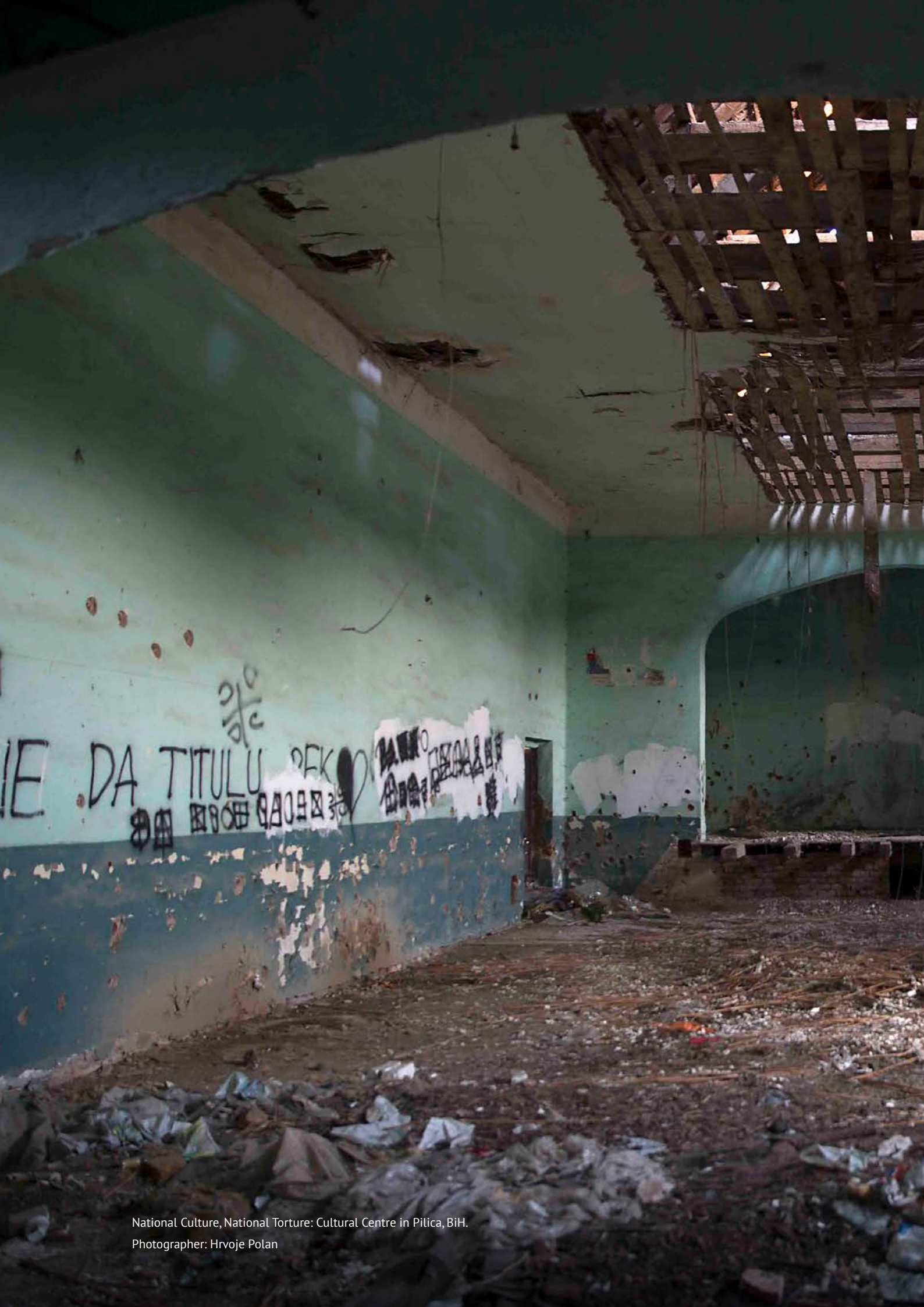
National Culture, National Torture: Cultural Centre in Pilica, BiH.