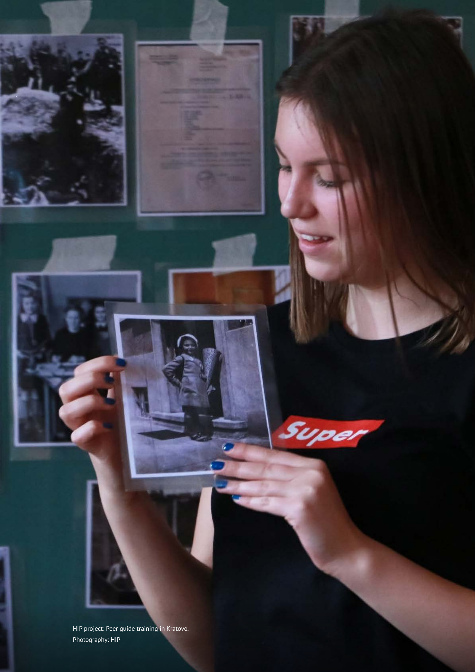
HIP project: Peer guide training in Kratovo.