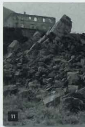
Targeting History and Memory: Exhibition at the Glipoteka in Zagreb, Croatia.