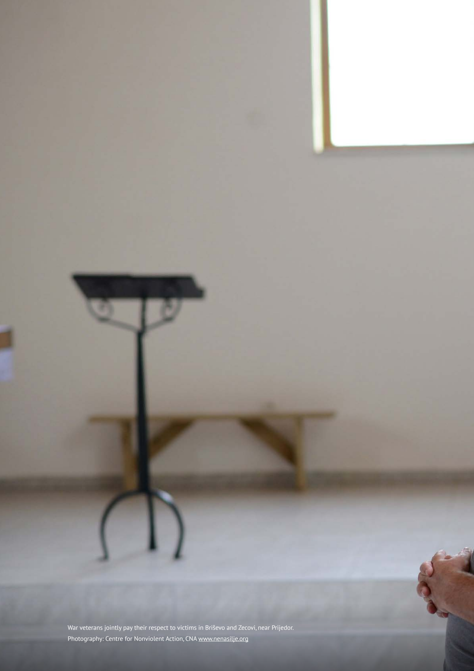
War veterans jointly pay their respect to victims in Briševo and Zecovi, near Prijedor.