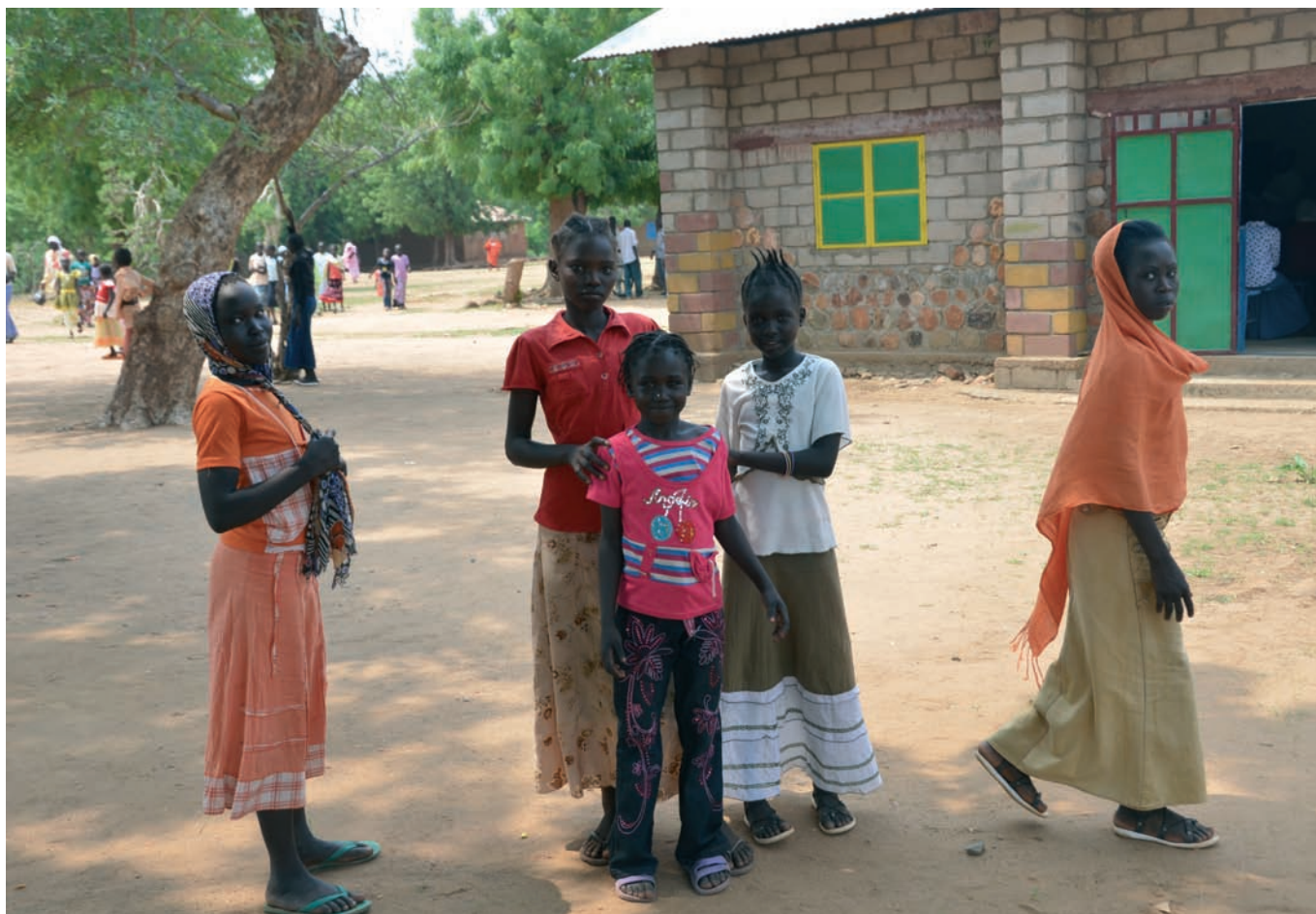
Nuba kinderen op het schoolplein.

elderly mortality from malnutrition is expected to increase drastically over the coming months. A survey among 2,594 children in the Delami region, in the north-east of the mountains where government forces have looted and burned food stores, found 4.7 per cent suffering from severe malnutrition. Many were suffering from diarrhoea (32 per cent), vomiting (17 per cent), fever (23 per cent) and coughing (30 per cent), suggesting the presence of underlying diseases such as malaria, pneumonia and dysentery. Unless these conditions are treated and nutrition rapidly improved, malnutrition levels will deteriorate rapidly given the plethora of other aggravating factors.