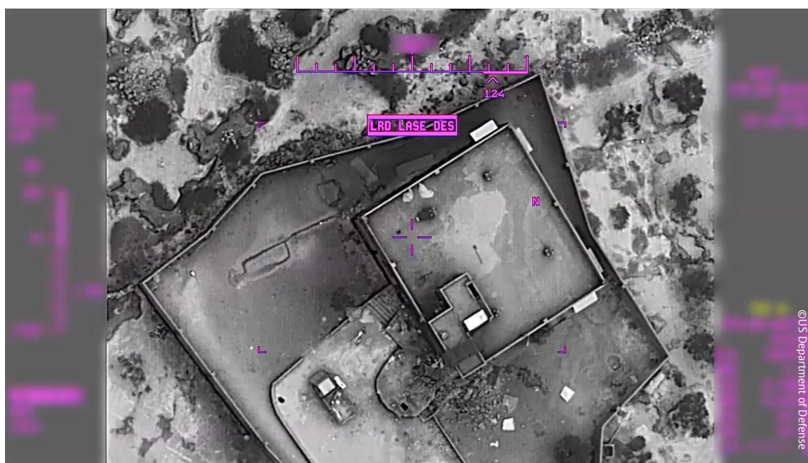
A screengrab from military drone video shows the compound of ISIS Leader Abu Bakr al-Baghdadi moments before a precision-guided munition strike following the US forces raid, northwestern Syria, 26 October 2019.

The United States started drone surveillance missions to ISIS positions in Syria in August 2014. At that point, direct military action had not yet been authorised, but the gathering of intelligence was the first step towards the US becoming militarily involved in the Syrian conflict, and the surveillance missions would ultimately support air strikes. The rise of ISIS and the subsequent horrific attacks on non-Sunni communities, specifically Yazidis and the takeover of Mosul signalled a change in President Obama's policy from supporting regime change in Damascus to defeating ISIS. 60 The Global Coalition against Daesh, led by the US, was formed in September 2014 and started countering ISIS in Iraq in what was termed Operation Inherent Resolve (OIR). 61 Soon after, the coalition started to launch airstrikes against ISIS in Syria. 62 The first US drone strike against ISIS in Syria was carried out in August 2015, from the Incirlik base in Turkey. The US and Turkey were allies in their fight against ISIS. 63 The US ended up using targeted killings of members of ISIS and other jihadist groups as their prime counter-terrorism effort in Syria, but tended not to claim responsibility for such assassinations. 64