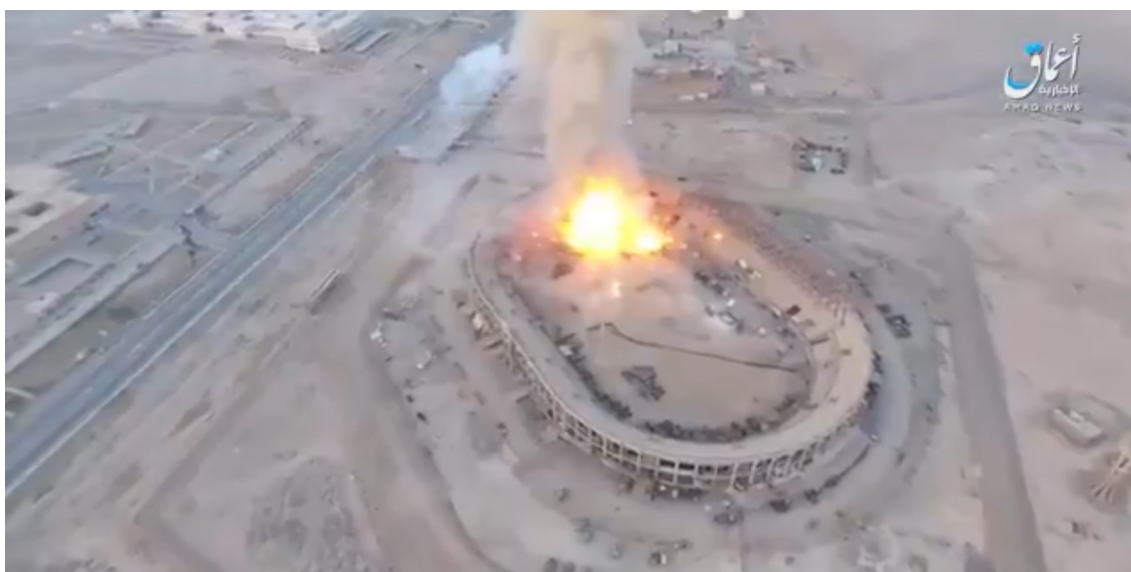
Drone footage released by ISIS shows a weaponized commercial drone attack Syrian regime ammunition stockpiles in the Deir ez Zor stadium. October 24, 2017