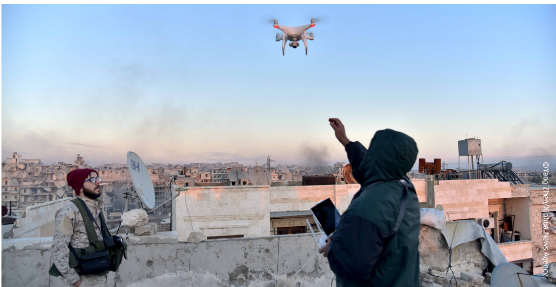
A Syrian government soldier controls a drone to investigate the rebel-held area in Aleppo, Syria on Dec. 18, 2016

The Syrian regime does not produce its own drones but it has received material support from Iran and Russia in its fight against armed (opposition) groups, either used by the regime itself or by Hezbollah, which has fought alongside the Syrian army. 20 An example of the support these drones offer to the Syrian army is aerial footage of specific locations inside areas like Homs that were then controlled by opposition parties, allowing the army to track, survey and, in combination with other assets, target armed opposition groups and their infrastructure. The Syrian regime and linked militias have also deployed (armed) drones against the US-led coalition against ISIS in Syria. 21 Unarmed Syrian reconnaissance drones were spotted in 2018 in Israel or near the occupied Golan Heights, but there has been no confirmation whether they were there intentionally or by accident whilst attempting to defeat armed opposition groups in southern Syria. These drones were immediately shot down by the Israeli army. 22 There are sources stating that Syria's Scientific Research Centre manufactures drones domestically, but all online footage shows that these are probably either Iranian or Chinese drones or copies assembled in Syria. 23 According to visual media collected by the Center for the Study of the Drone, six types of Iranian drones have been reported