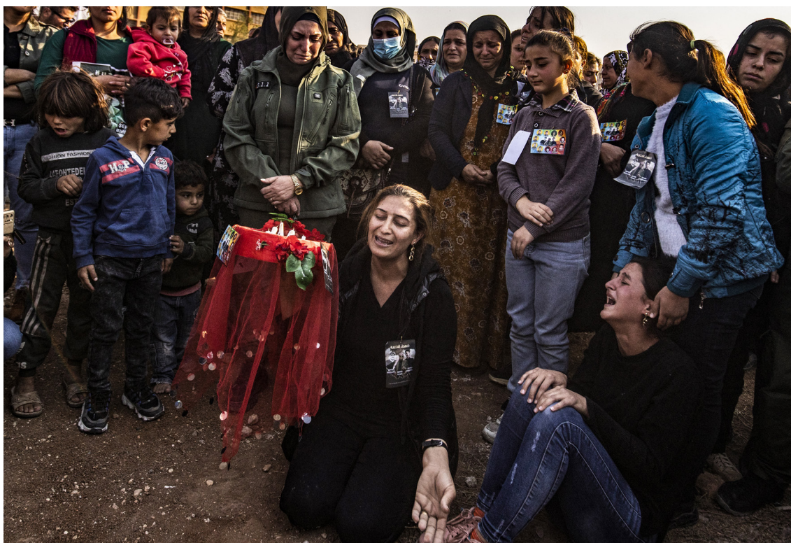
A woman reacts as she mourns the death of civilians killed in a reported Turkish drone strike two days prior, during their funeral procession in the northeastern Syrian city of Qamishli, on November 11, 2021.