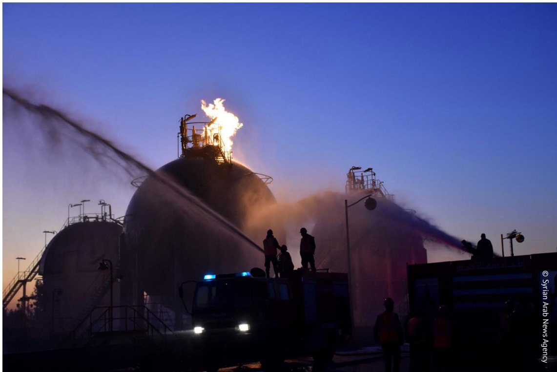
Handout photo made available by Syria's official Syrian Arab News Agency (SANA) shows firefighters extinguishing a fire at a gas and oil storage in central Syria, 21 December 2019. The Syrian state agency claims that drone attacks were carried out on gas and oil facilities in the Homs region.

Al-Nusra, and its successor Hay'at Tahrir al-Sham (HTS), is a militant group in Syria that became a major actor in the conflict after 2012 and managed to effectively control parts of the Idlib governorate. HTS is another non-state actor that acquired relatively cheap and readily available class I drone technology. The group not only used drone technology for ISR purposes but also tried to establish legitimacy by celebrating their drone capabilities in propaganda videos. 110 Al-Nusra/HTS has primarily been active in the Idlib governorate, where they use civilian drones and convert them into drones capable of serving their military objectives. Drone attacks by the militants have also been reported in Hama and Aleppo. As the rebel group's drone capabilities improved over the years, their drones were increasingly being armed. Their prime targets have been airports/air bases, oil facilities and the positions of states' armies. 111