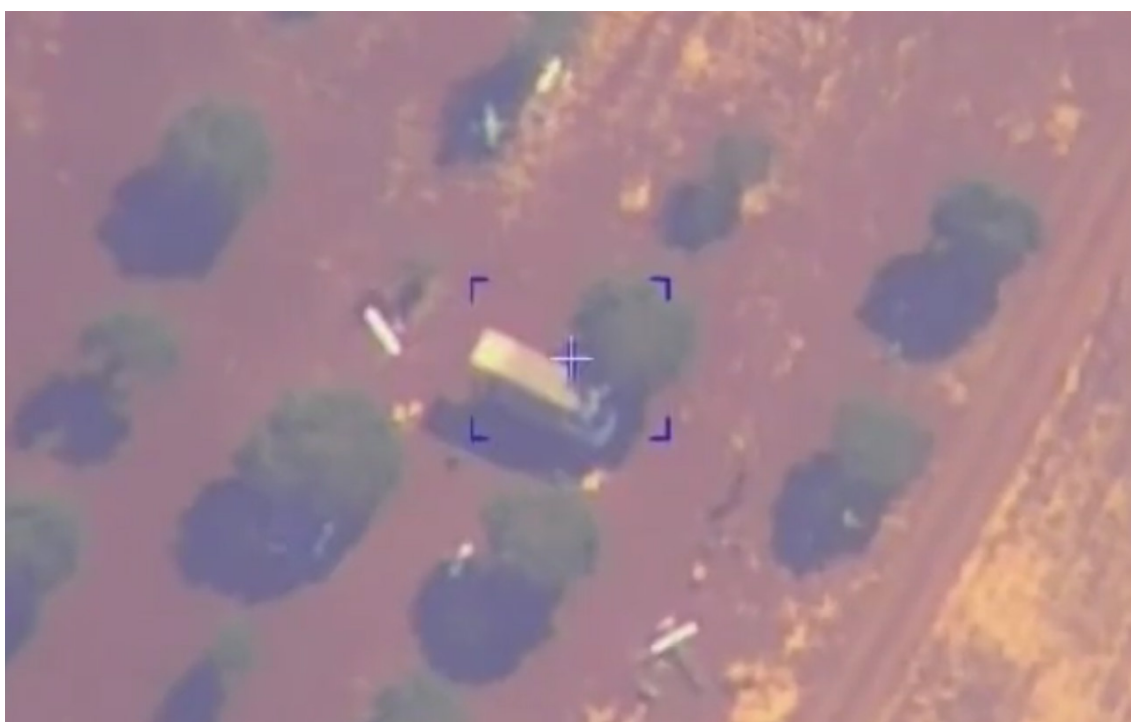
Aerial footage shows Russian airstrikes against armed groups in Idlib that are about to launch several drones in Idlib.

By and large, the Syrian war has shown that NSAGs are willing to use weaponised commercial drones to target key energy infrastructure facilities owned and/or used by state actors in addition to military targets.