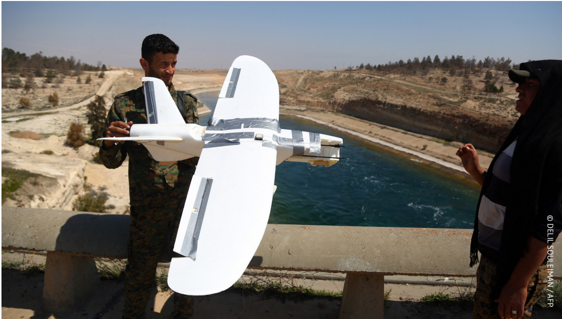
Members of the US-backed Syrian Democratic Forces (SDF), made up of an alliance of Arab and Kurdish fighters, inspect on March 29, 2017 a downed drone, reportedly belonging to the Islamic State group and being used to spy on SDF positions, at the Tabqa dam.

Overall, ISIS has shown how an armed group can use DIY weaponised commercial drones to exploit security gaps in states' armed forces. Utilising cheap technology has turned out to be effective in putting pressure on highly sophisticated and organised militaries, ultimately forcing states to invest in their security measures. ISIS has exerted this pressure by striking military targets (both people and infrastructure) and energy infrastructure. ISIS has been able to weaponise civilian drones by means of complex procurement networks. ISIS has made use solely of class I drones for striking, ISTAR and (highly mediated) propaganda purposes. Altogether, drones have provided ISIS with unprecedented capabilities and possibilities to commit violence and exercise power, which in turn pose new challenges for states' military forces.