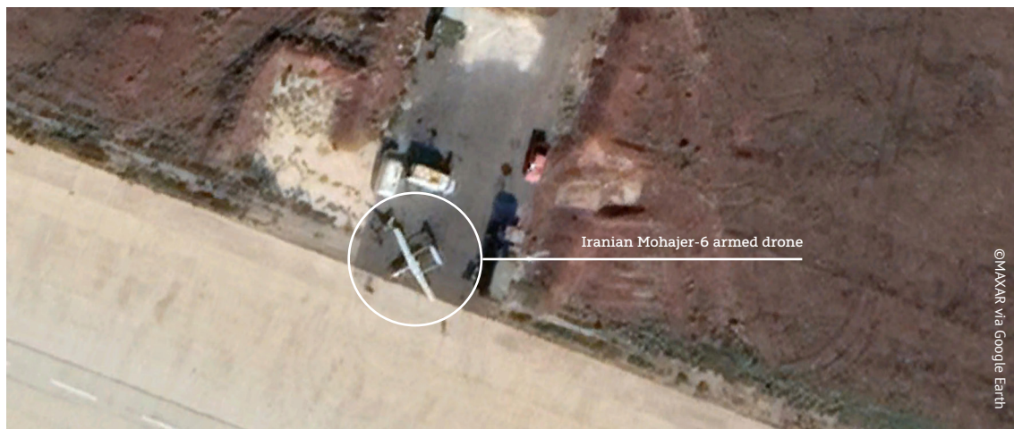
An Iranian Mohajer-6 drone and the command and control station seen on the Hama Air Base, Syria. November 6, 2019