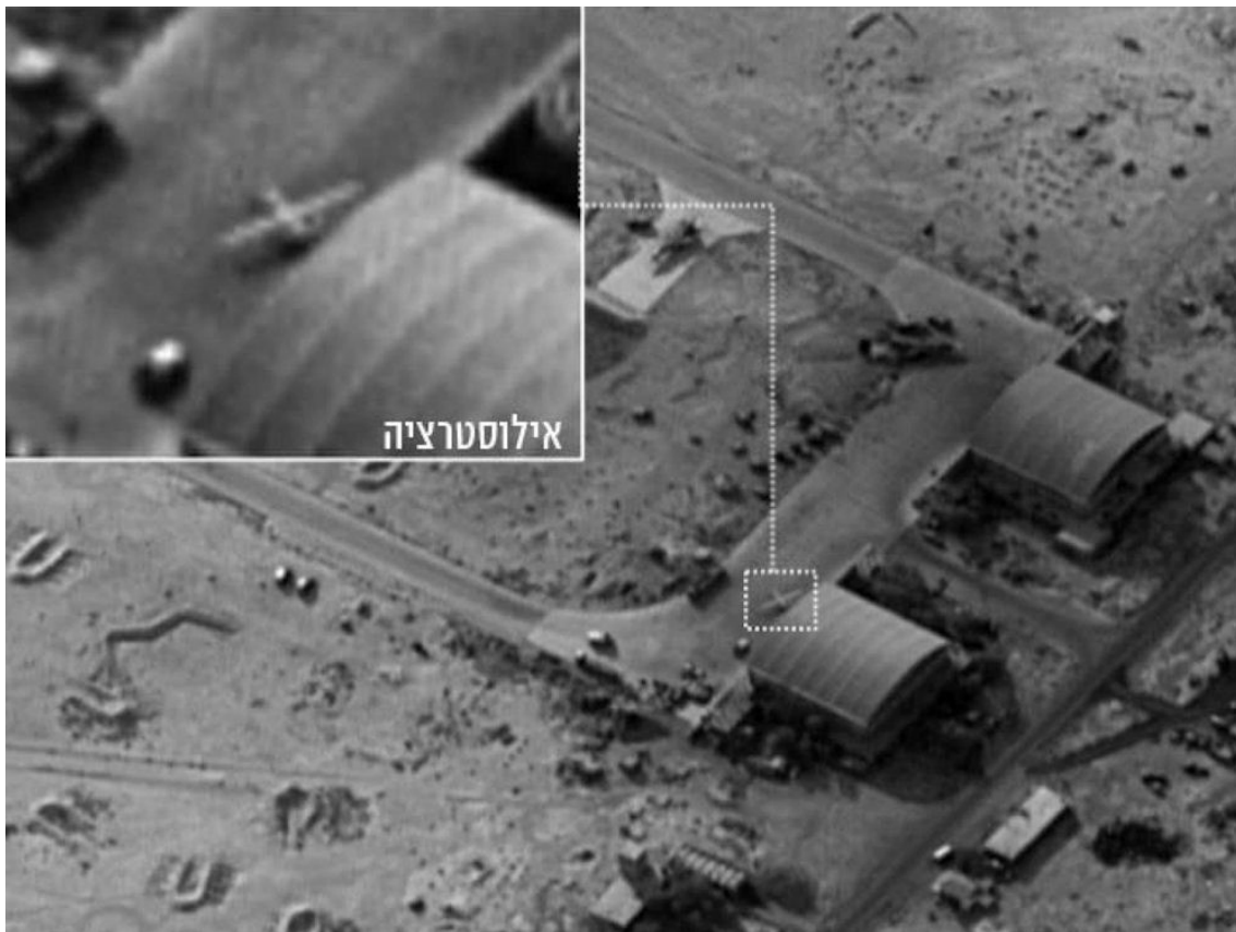
An Iranian Shahed-129 drone at the Syrian T-4 airbase. Photo released by the Israeli Ministry of Defense in February 2018.

In addition to the larger type of military drones used by Iran, Syria also saw the first use the Lancet suicide drone, by Russia, and further use by the US of the Switchblade, a similar type of drone, and allegedly also the Turkish Kargu loitering munitions. Easy to carry and deploy, these precision drones with small but effective payloads have since been deployed on a larger scale in the Ukraine war. Considering the potential effective use by ground forces and their cheap production and easy use, we are likely to see wider development and deployment of such small but lethal military drones in the near future.