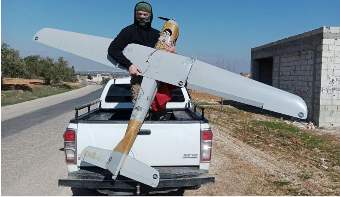
A rebel holds an crashed Russian Orlan-10 reconnaissance drones. Image posted on Twitter, February 7, 2021

Russia's main larger drone that has been in frequent use in the war is the Forpost, the design of which is based on the Israeli ISR Searcher drone. Russia had received Searcher drones and training on how to operate them from Israel Aerospace Industries (IAI) by 2010; it had requested this in response to the 2008 Russo-Georgian War. Russia also acquired the licence to produce copies of the Searcher drone domestically, which it dubbed the Forpost and deployed in Syria. Photographs and satellite images appear to show the Forpost at the Khmeimim air base in Latakia and at Aleppo Airport. 38