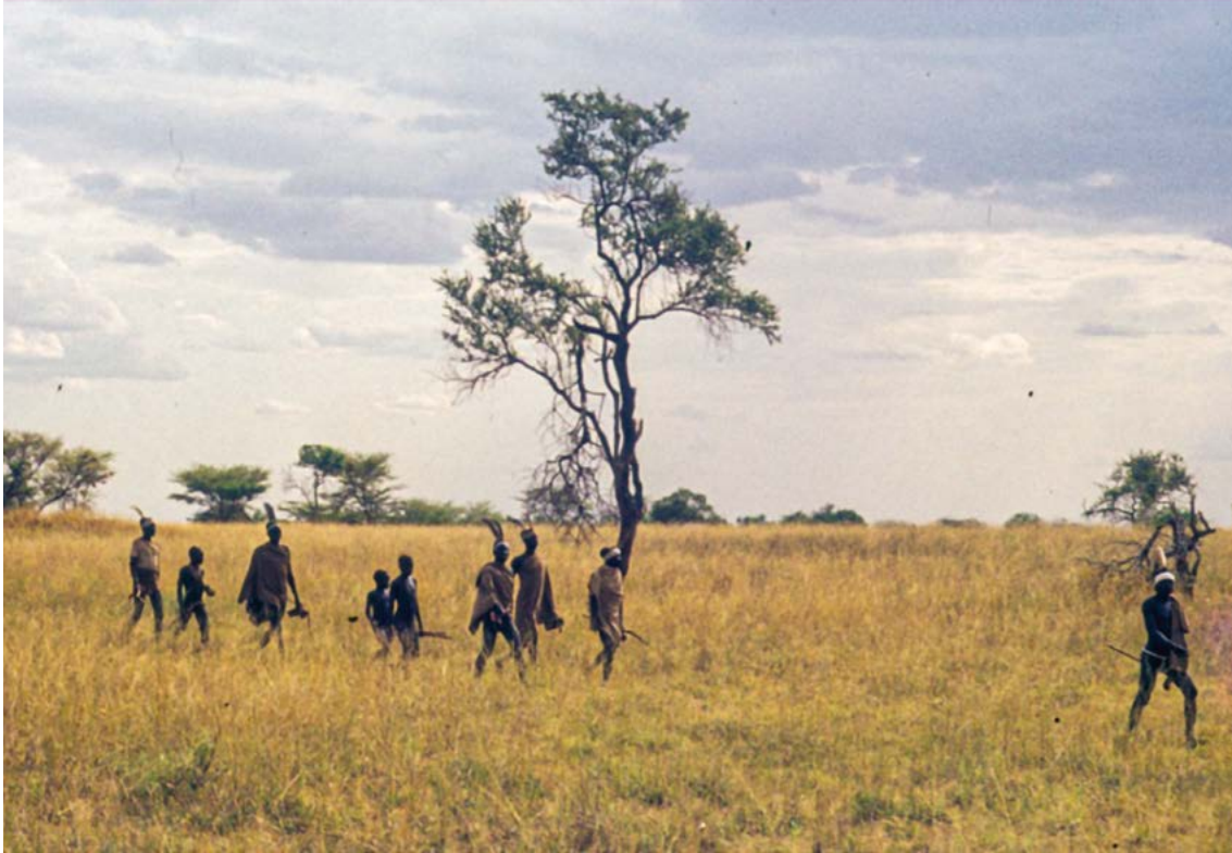
FIGURE 3: Nyangatom trek from Omo River villages to Kibish River and Ilemi Triangle settlements. Image by Carr (2017, 147), licensed under CC BY 4.0.