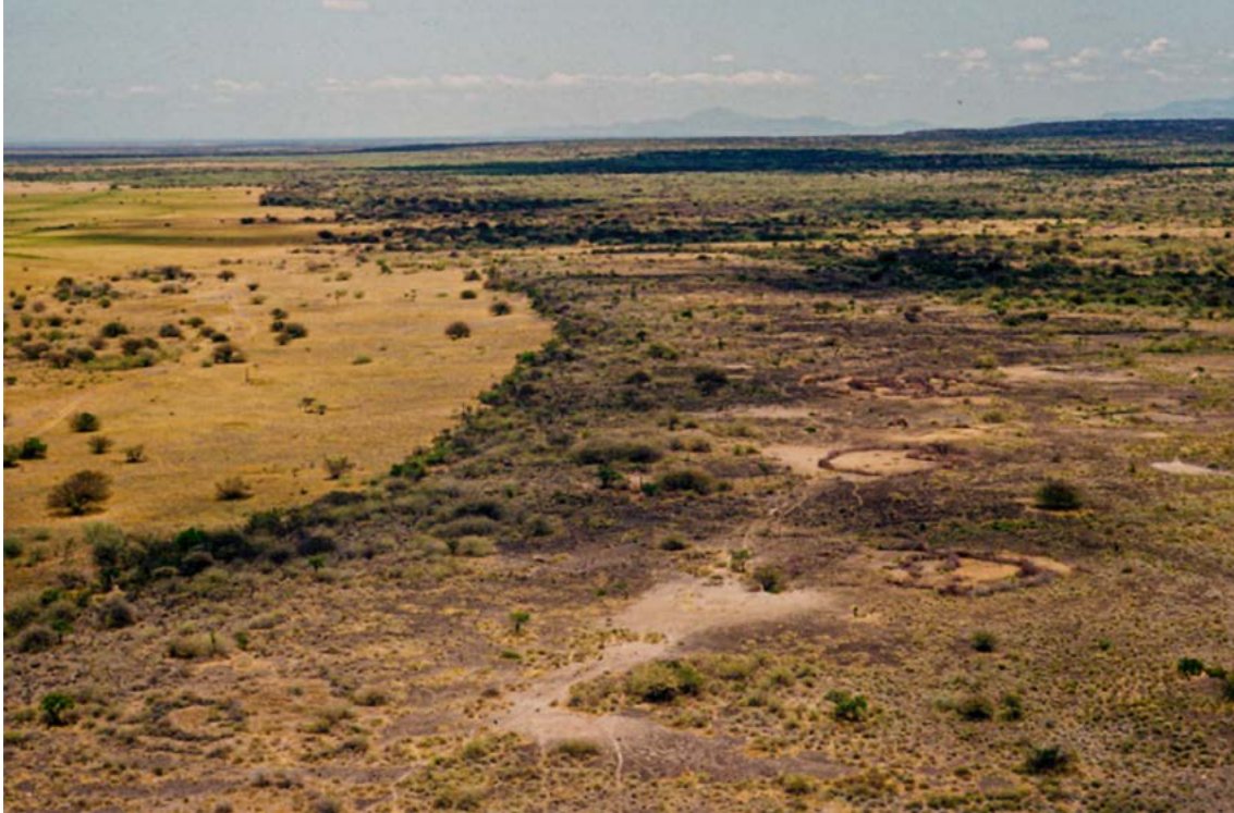
Figure 2: Ilemi triangle border area with Ethiopia. Lightly grazed Ilemi grasslands on relict beach ridge to the left; heavily grazed area with pastoral villages (present and abandoned) to the right. Image by Carr (2017,83), licensed under CC BY 4.0.

pastures (De Vries & Wunder 2017; Nicholas 2018). Cattle raiding has long been considered a culturally accepted enterprise between pastoralist tribes, and a legitimate way of acquiring wealth (Amutabi 2010; De Vries & Wunder 2017; Nicholas 2018). Community elders developed local ethical standards under which these raids took place and only traditional weapons – such as spears, bows and arrows – were used (Nicholas 2018). Since the 1970–80s and the circulation of weapons due to the civil wars in Sudan, however, the violence around cattle raiding has escalated. This has resulted in deadly cattle raids and a culture of banditry in which raiding has become an end in and of itself. Increasingly, raiding has been motivated by self-acquisition rather than communal interests. The control of elders through the generation-set system has also weakened and armed kraal leaders have gained influence (Rugadya 2006; De Vries & Wunder 2017; Nicholas 2018).