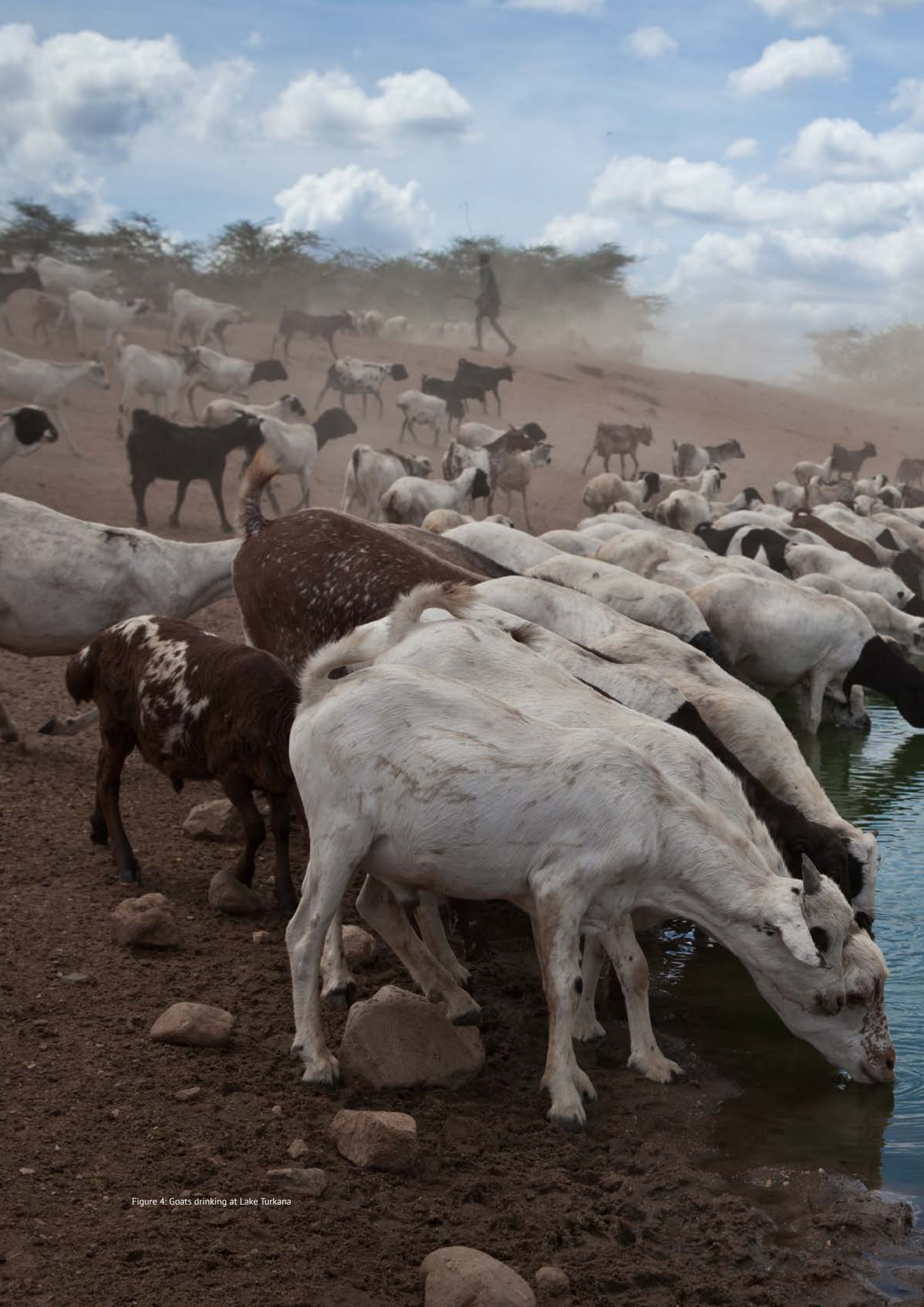
Figure 4: Goats drinking at Lake Turkana