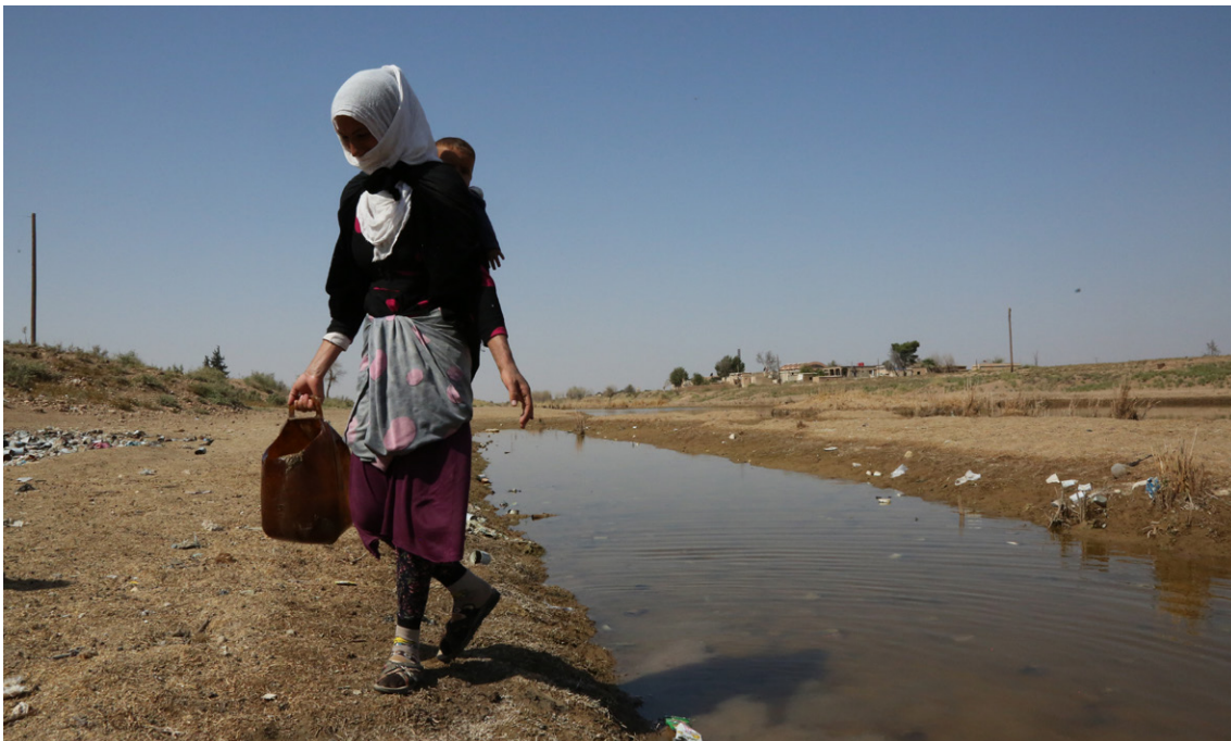
A woman with her child is fetching water from a small creek, Tal Al-Wuah, Hasakah. October 10, 2021

These findings assess the state of rural northeast Syria, with a focus on its largely overlooked pastoralist community. These people and their farming peers are struggling with a potent blend of ongoing hostilities and intensifying climate stresses, in addition to long-term resource mismanagement, which are trapping them in a vicious feedback loop of insecurity and deprivation. Their plight has largely been ignored over the war, even as they’ve emerged as one of the most vulnerable cross-sections of society. As part of PAX’s work on climate, conflict, and environmental security in the Middle East, this report explores the humanitarian and potentially peace-rupturing consequences of the crisis in rural Syria. The imperative for action is clear.