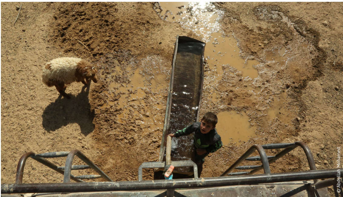
A water truck is used to provide for the sheep. Tal Wardiyat, October 10, 2021

Syria has experienced almost every imaginable horror over the past decade. Yet, here in rural parts of the heavily agrarian northeast, there are the makings of a slow-moving disaster that could ultimately match or perhaps surpass previous crises. A particularly bad drought year has bled into the consequences of extended conflict, grimmer macroeconomics, and other non-climate environmental challenges to hobble pastoralism and agriculture, the livelihoods that had arguably withstood the war better than most – and that have assumed a greater economic significance as a result. This rural misery, which has been amplified by a near-total lack of state capacity after so much fighting, is fragmenting some of the few areas of comparative normality the country has left.