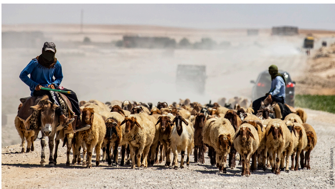
Local herders with sheep on the Raqqa countryside, December 20, 2020.

Snarled in this cruel web, pastoralists have tried to offload livestock. Here, too, though they've been stifled at almost every turn. Spindly, underweight sheep and goats command such low prices at local markets as to be barely worth selling. This kind of livestock is of no interest to traders in neighbouring Iraq, who must pay up to $30 per animal in import taxes and so prioritise heftier ones, or to cross-border smugglers who doubt these skinny beasts would survive the arduous trip. In these circumstances, shepherds are watching their herd sizes fall by at least half, if not considerably more, due to starvation and disease, agricultural officials say.