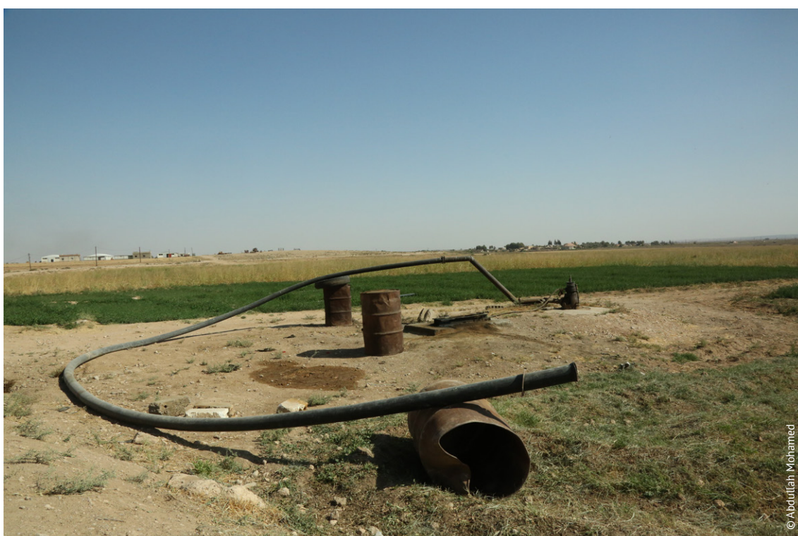
A water well used for irrigated cropland, Tal Wardiyat, Hasakah. October 10, 2021

With little money and soaring import costs because of the continued collapse of the Syrian pound, now some 80 times weaker against the dollar than it was pre-war, farmers have been unable to afford or source quality seeds or fertilisers or diesel to man their pumps for irrigation as they previously did during drought. Vast tracts of prime farmland are sitting fallow as a consequence, which is fueling food insecurity and depriving pastoralists of affordable fodder. Local production of barley, a vital crop staple, is down by more than a million tons, in large part due to rainfall that has shrunk by a third in places. 3 And with intensifying instability as the so-called Islamic State (IS) and other armed actors regroup along the northeast' semi-arid periphery, pastoralists (also known as herders) have lost access to vital grazing land and markets.