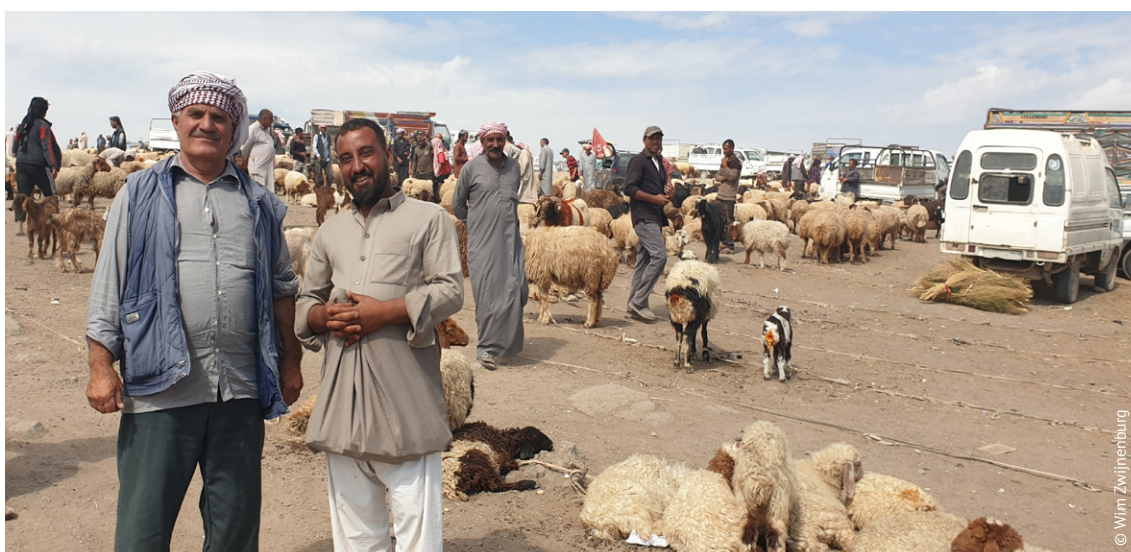
Sheep traders at a bustling livestock market near Darbasiyah, September 24, 2021

Nowhere, however, is the impact of 2021's turbulence more acute than among the isolated rural communities where there are zero options beyond pastoralism and agriculture and where residents were already living hand-to-mouth before the war. In these villages, fewer parents have the money to clothe, transport, or equip their children with textbooks for school. Fewer families have the funds to seek out whatever medical care still exists, which means more physical – and mental – health woes are going untreated or undiagnosed. Village mayors describe frequent suicides, a previously rare phenomenon and part of a startling upsurge in psychological ailments.