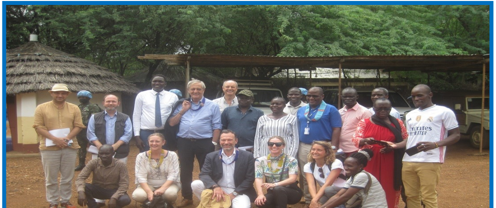
Group photo of UNMISS delegation members who visited Kuron Peace Village on 25.May.2022.