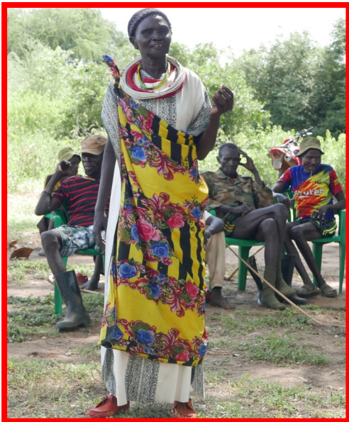
Madam Kuron speaks out at a Village Meeting

I am busy throughout the day with cleaning, cooking, and preparing things for sale. There are many people who come to me every day to discuss certain issues. We also have a small garden here in the compound but during the dry season we can't plant anything.