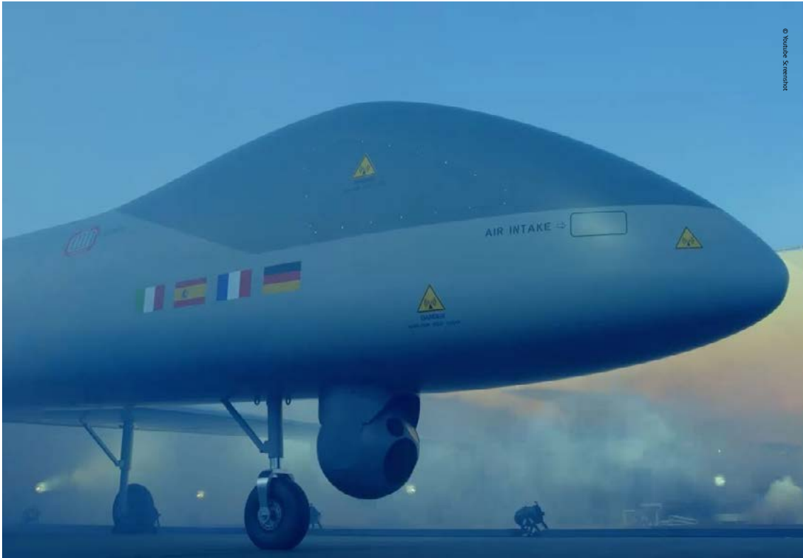
The European MALE RPA revealed in 2018.

The Eurodrone's role in 'strategic autonomy' also refers to the capability which sets it apart from other EU-supported drone projects: the ability to carry arms, and hence provide an alternative to the US's Reaper and Predator drones. Depending on these imports for an armed drone capability poses risks, as became clear when Italy's decision to weaponise its US-built drones had to be approved by the US Department of State, which gave its approval four years after Italy requested it. 70 The then German Defence Minister and soon to be President of the European Commission Ursula von der Leyen noted that: