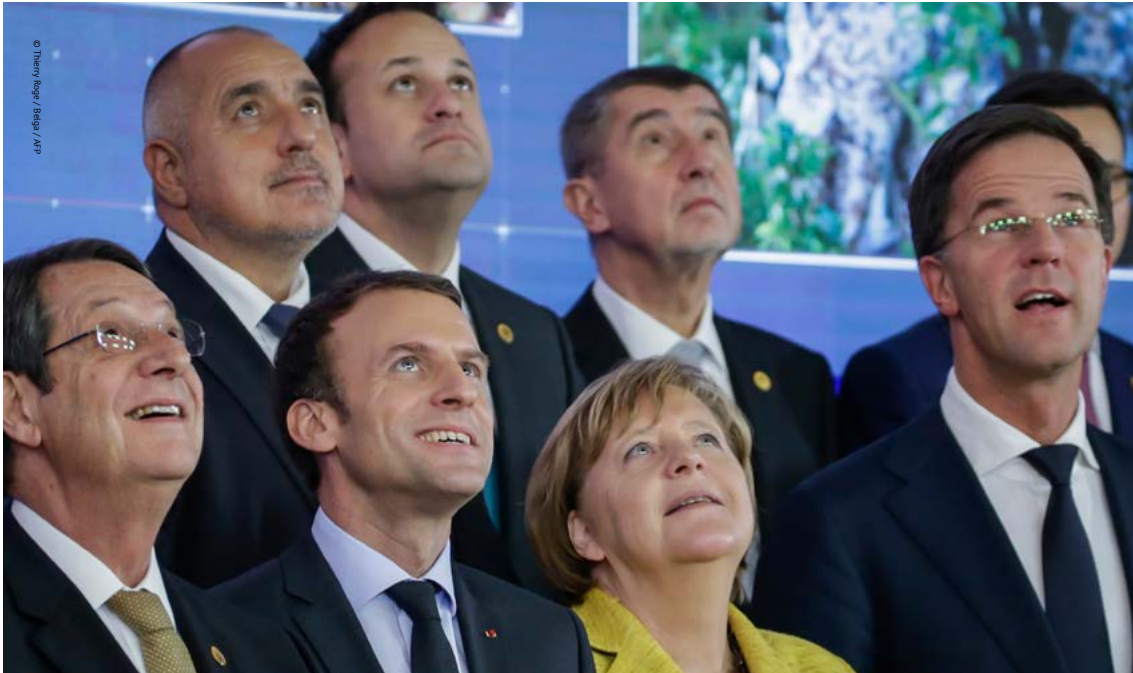
European leaders watch a drone demonstration during the launch of the Permanent Structured Cooperation, (PESCO), a pact between 25 EU governments to fund, develop and deploy armed forces together, at the European Council on December 14, 2017 in Brussels, Belgium.