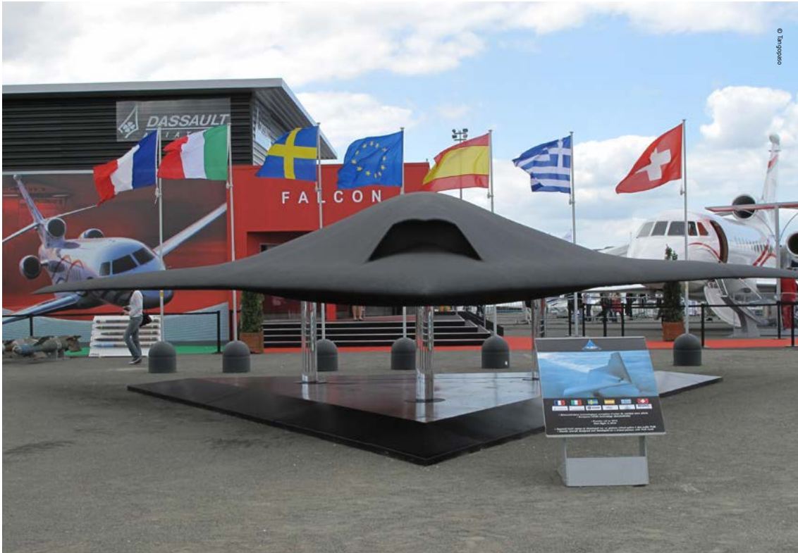
Mockup of Dassault Neuron at the Paris Air Show 2009

Although showing awareness that this might infringe on legal principles regarding export controls of dual-use goods and technologies, the Commission stated that “care should be taken in future to ensure that these controls do not hamper the competitiveness of the EU defence industries”.