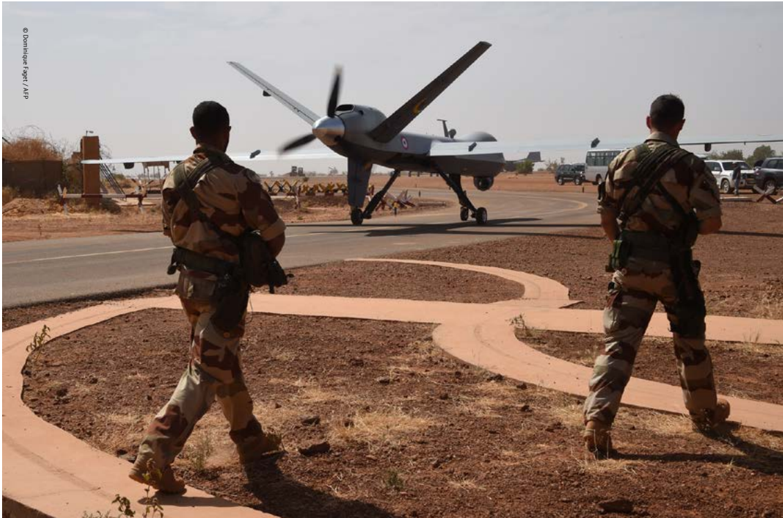
French soldiers of the aerial detachment of the Operation Barkhane stand guard near a Reaper drone about to take off from the Nigerian military airport Diiori Hamani in Niamey on January 2, 2015. Operation Barkhane is an anti-Islamist operation in Africa's Sahel region beginning in July 2014 which consists of a 3,000-strong French force.

(ISR), Remotely Piloted Aircraft Systems [...] response to hybrid threats; as well as other capabilities, in particular those needed to ensure cyber and maritime security, and force protection.” 150