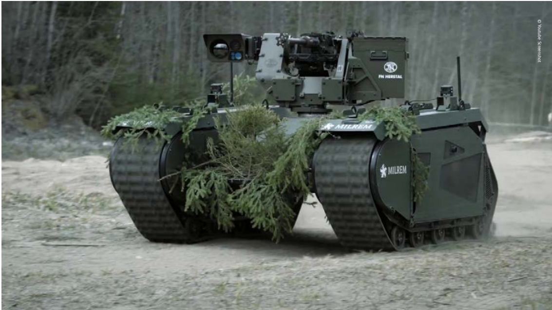
The THeMIS unmanned ground vehicle, equipped with a machinegun.