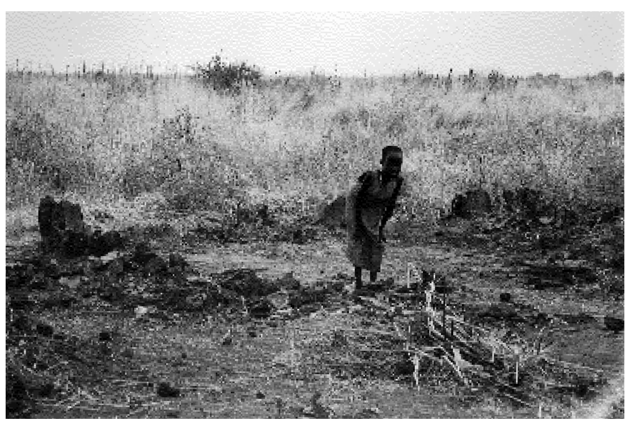
A child looks for firewood in the wreckage of her home, burnt by government troops in a policy of 'scorching' the area.

area in order to allow oil exploration to proceed unimpeded. They say the attackers – primarily government militias, some of them newly organised and armed – are avoiding military targets and attacking only civilians.