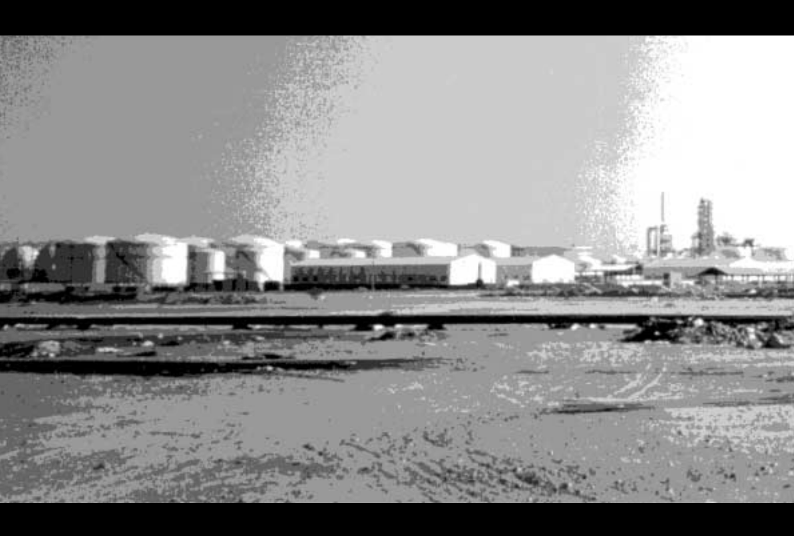
Greater Nile Petroleum Operating Company (GNPOC) oil facility, Sudan