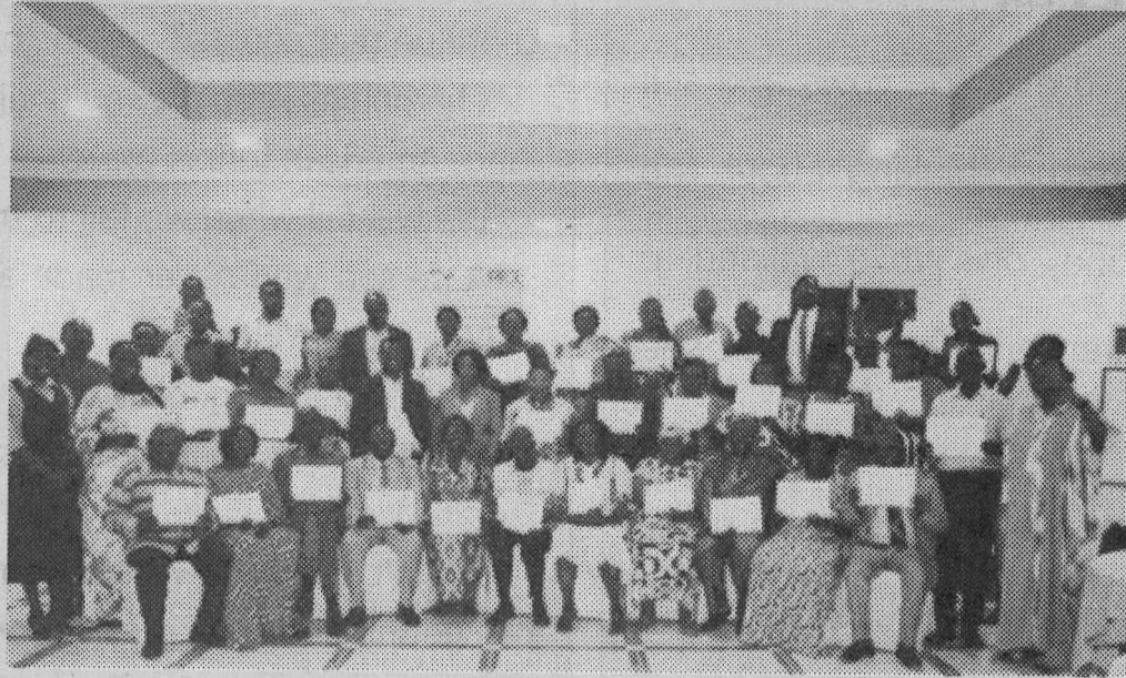
Participants in a group photo after the closing session.