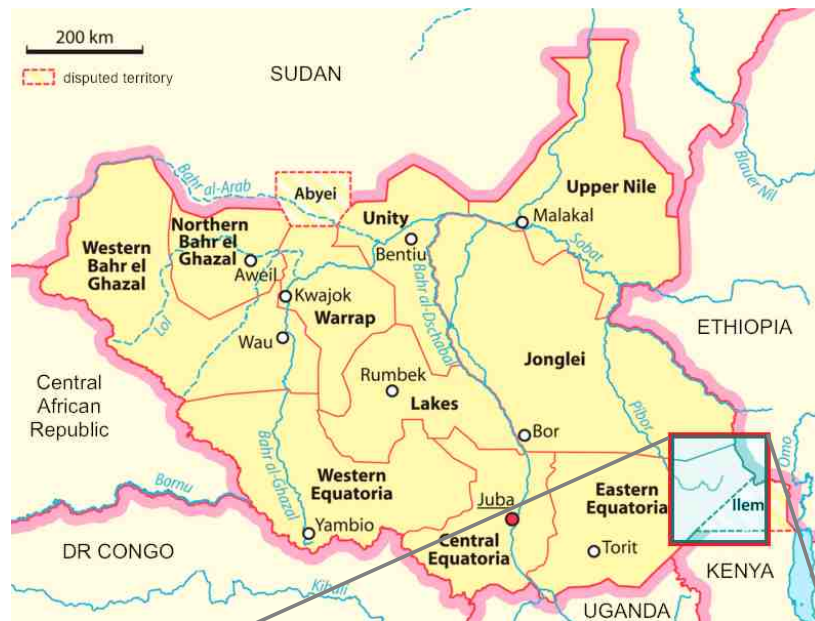
Map 1: South Sudan