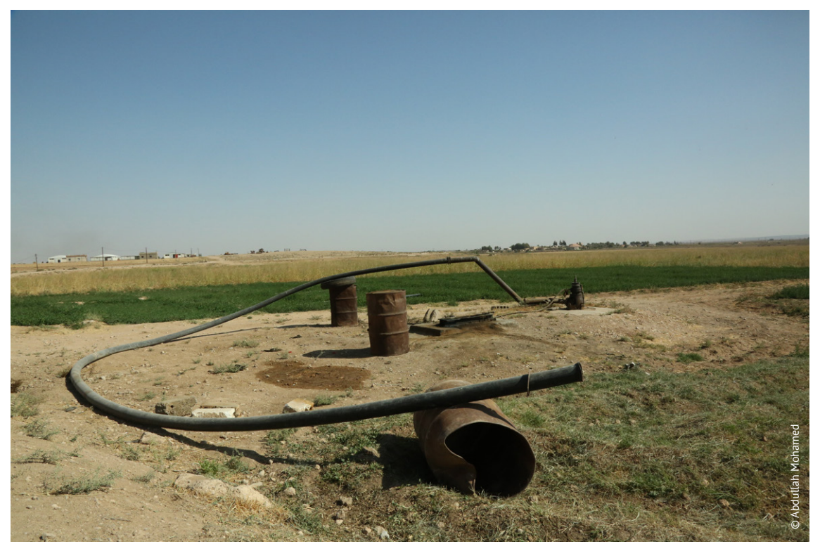
A water well used for irrigated cropland, Tal Wardiyat, Hasakah. October 10, 2021

With little money and soaring import costs because of the continued collapse of the Syrian pound, now some 80 times weaker against the dollar than it was pre-war, farmers have been unable to afford or source quality seeds or fertilisers or diesel to man their pumps for irrigation as they previously did during drought. Vast tracts of prime farmland are sitting fallow as a consequence, which is fueling food insecurity and depriving pastoralists of affordable fodder. Local production of barley, a vital crop staple, is down by more than a million tons, in large part due to rainfall that has shrunk by a third in places.<sup>3</sup> And with intensifying instability as the so-called Islamic State (IS) and other armed actors regroup along the northeast' semi-arid periphery, pastoralists (also known as herders) have lost access to vital grazing land and markets.