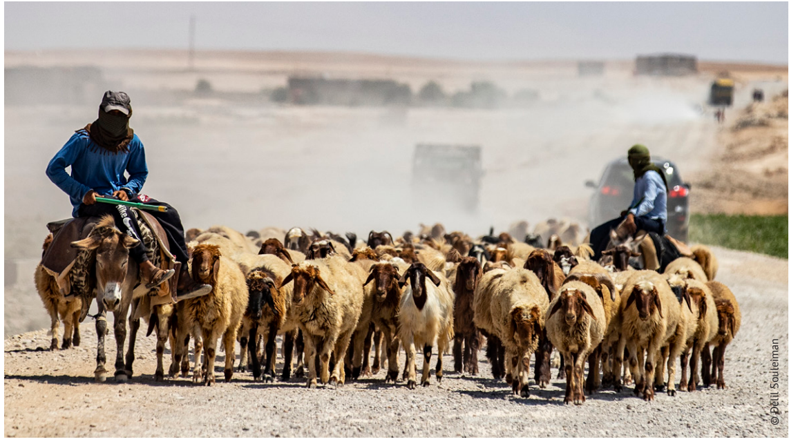
Local herders with sheep on the Ragga countryside, December 20, 2020.

Snarled in this cruel web, pastoralists have tried to offload livestock. Here, too, though they've been stifled at almost every turn. Spindly, underweight sheep and goats command such low prices at local markets as to be barely worth selling. This kind of livestock is of no interest to traders in neighbouring Iraq, who must pay up to $30 per animal in import taxes and so prioritise heftier ones, or to cross-border smugglers who doubt these skinny beasts would survive the arduous trip. In these circumstances, shepherds are watching their herd sizes fall by at least half, if not considerably more, due to starvation and disease, agricultural officials say.