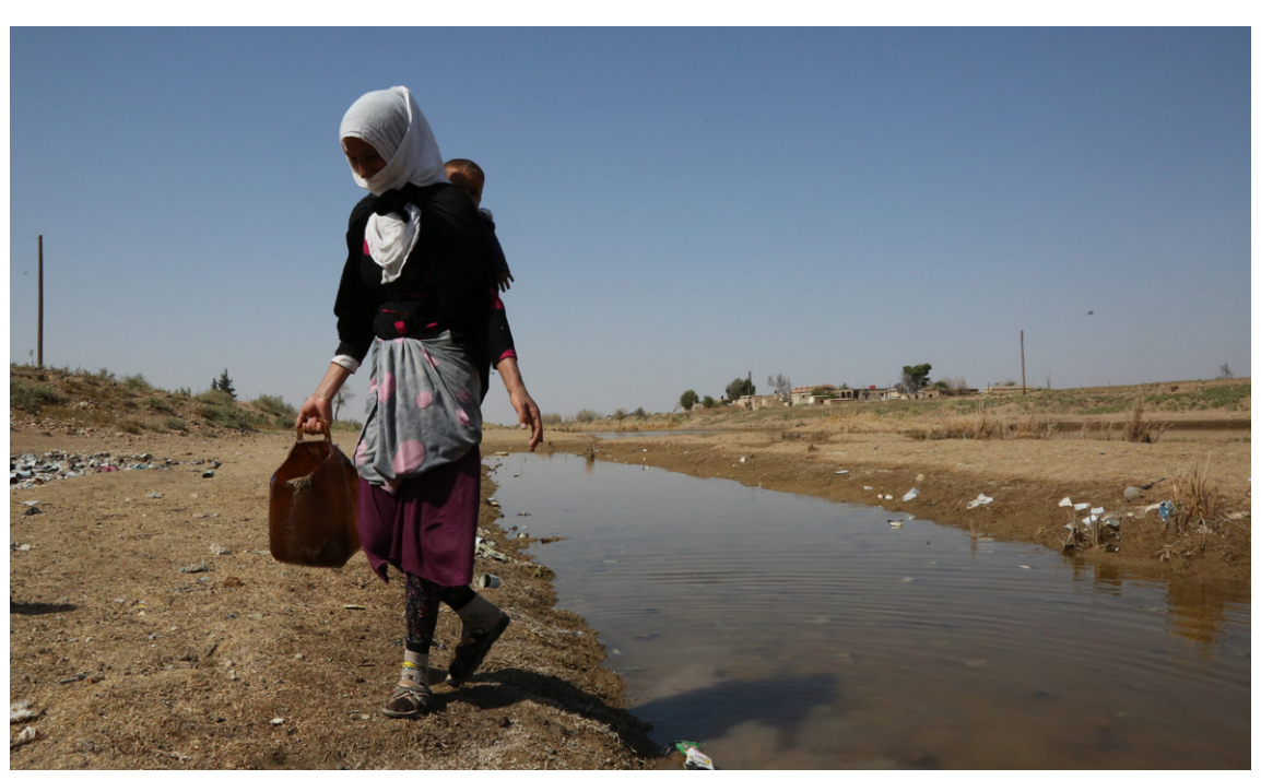
A woman with her child is fetching water from a small creek, Tal Al-Wuah, Hasakah. October 10, 2021

These findings assess the state of rural northeast Syria, with a focus on its largely overlooked pastoralist community. These people and their farming peers are struggling with a potent blend of ongoing hostilities and intensifying climate stresses, in addition to long-term resource mismanagement, which are trapping them in a vicious feedback loop of insecurity and deprivation. Their plight has largely been ignored over the war, even as they've emerged as one of the most vulnerable cross-sections of society. As part of PAX's work on climate, conflict, and environmental security in the Middle East, this report explores the humanitarian and potentially peace-rupturing consequences of the crisis in rural Syria. The imperative for action is clear.