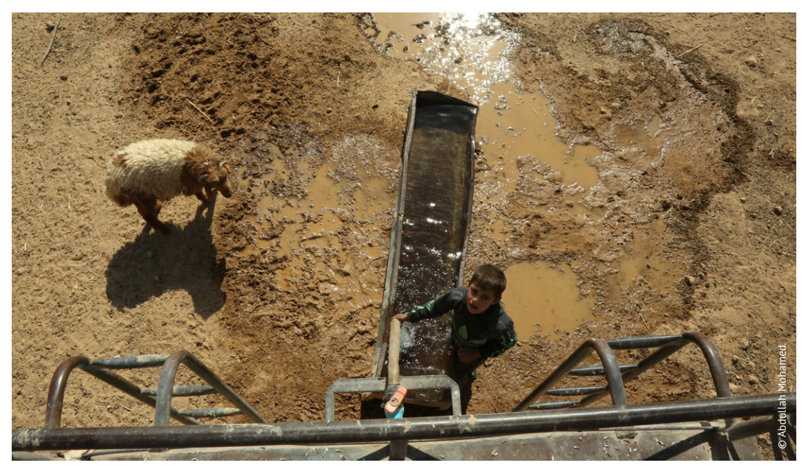
A water truck is used to provide for the sheep. Tal Wardiyat, October 10, 2021

Syria has experienced almost every imaginable horror over the past decade. Yet, here in rural parts of the heavily agrarian northeast, there are the makings of a slow-moving disaster that could ultimately match or perhaps surpass previous crises. A particularly bad drought year has bled into the consequences of extended conflict, grimmer macroeconomics, and other non-climate environmental challenges to hobble pastoralism and agriculture, the livelihoods that had arguably withstood the war better than most – and that have assumed a greater economic significance as a result. This rural misery, which has been amplified by a near-total lack of state capacity after so much fighting, is fragmenting some of the few areas of comparative normality the country has left.