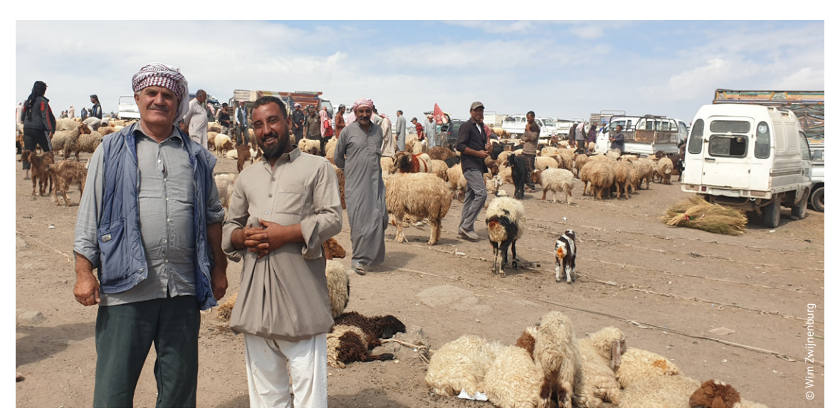
Sheep traders at a bustling livestock market near Darbasiyah, September 24, 2021

Nowhere, however, is the impact of 2021's turbulence more acute than among the isolated rural communities where there are zero options beyond pastoralism and agriculture and where residents were already living hand-to-mouth before the war. In these villages, fewer parents have the money to clothe, transport, or equip their children with textbooks for school. Fewer families have the funds to seek out whatever medical care still exists, which means more physical – and mental – health woes are going untreated or undiagnosed. Village mayors describe frequent suicides, a previously rare phenomenon and part of a startling upsurge in psychological ailments.